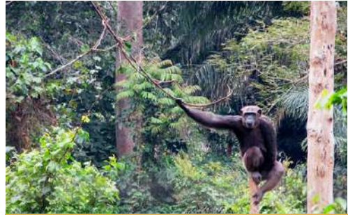
Mefou National Park and Ebogo Forest Reserve, Centre Region