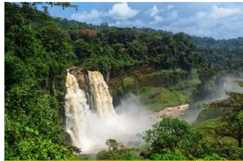
Ekoum-Nkam falls, Nkongsamba, Littoral region