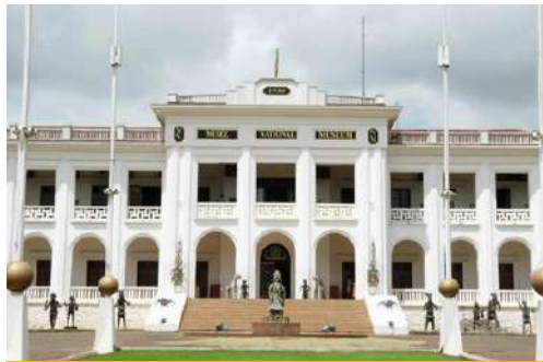
National Museum, Yaoundé