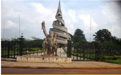
The Reunification Monument, Yaoundé