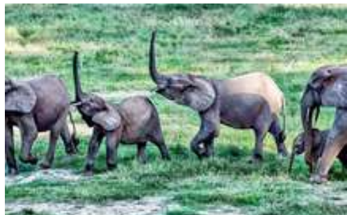
Lobéké National Park, East region